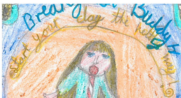
The winning designs