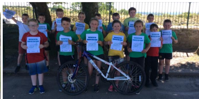
Safe Cycling Course