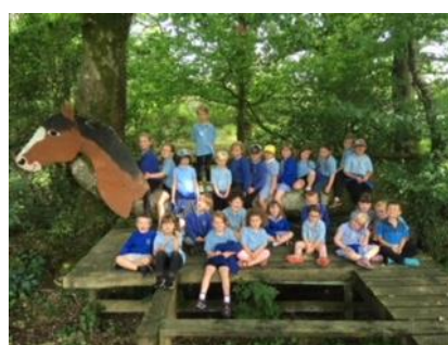
Foundation Phase Trip