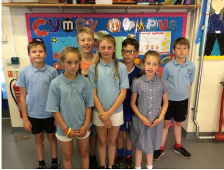
Swimming Gala Competitors