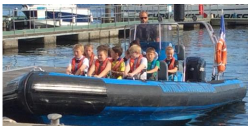
Cardiff Bay Visit