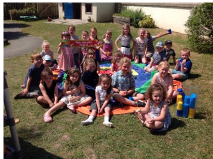
Cyw 10 th Birthday Celebration