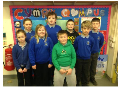
Indoor Sports Team