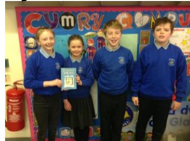
Year 5 and 6 Book Quiz Team