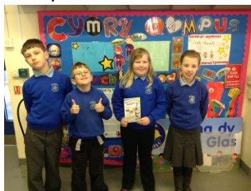
Year 3 and 4 Book Quiz Team