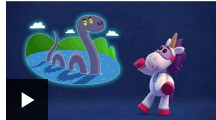
Loch Ness, Scotland