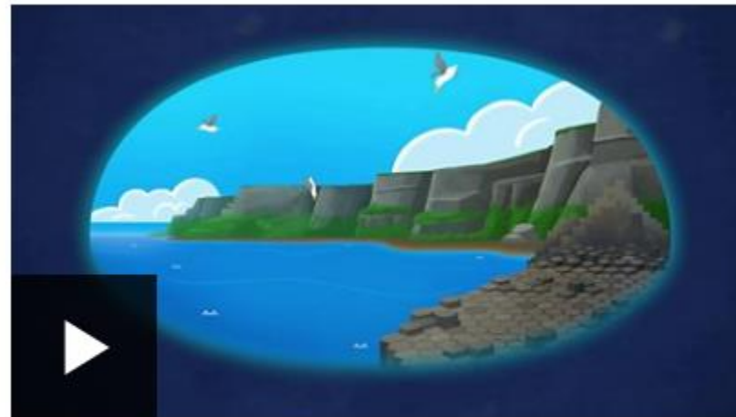
Giant's Causeway, Northern Ireland