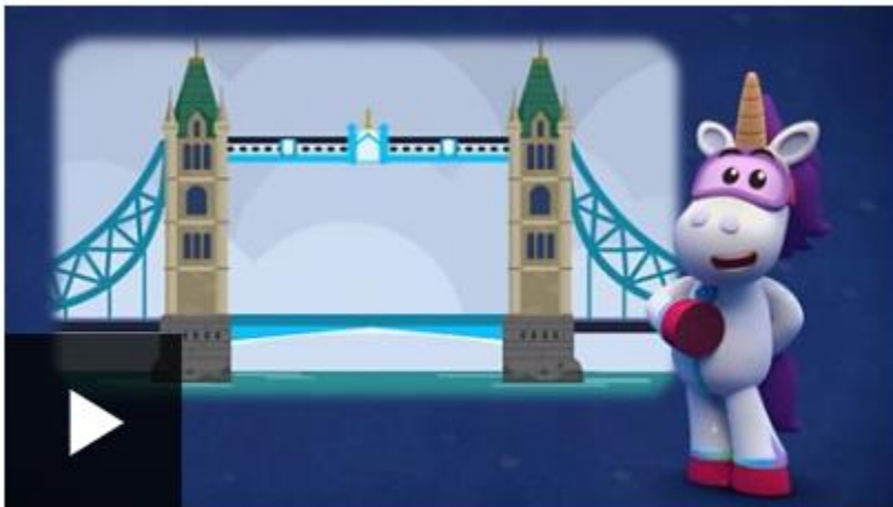
Tower Bridge, England