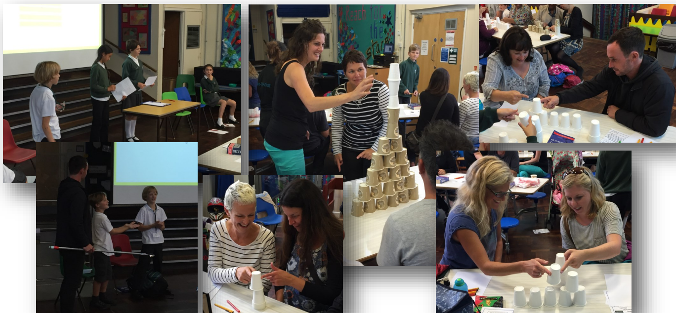
~ This week's attendance ~