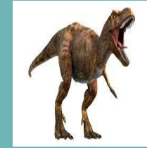
Dyma fi/This is me

Turn taking - I sometimes find it hard to wait my turn especially when I'm excited to share an idea. I need a prompt or a cue to remind me that my turn will come.