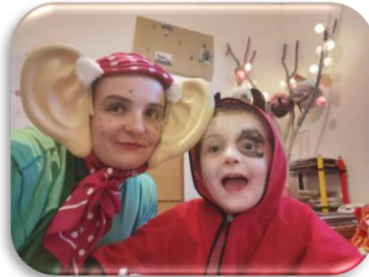
Year 1's The Three Billy Goats Gruff