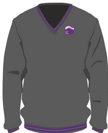
DARK GREY - PURPLE TRIM KNITTED V-NECK PULLOVER (BRANDED WITH SCHOOL LOGO)