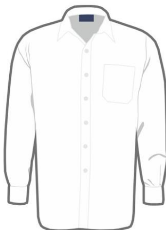
WHITE SHIRT (UNBRANDED)