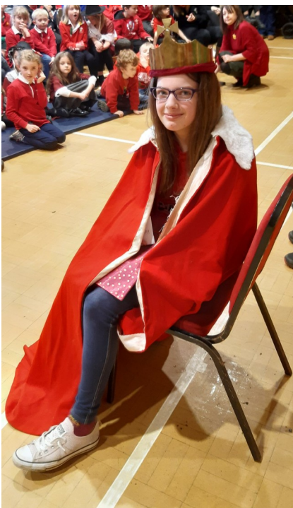
Crowning of the Bard 2020