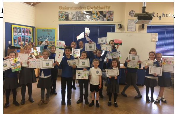
Criw Cymraeg's Croeso Competition