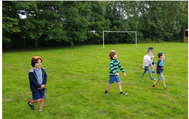
A socially distanced Sports Day!