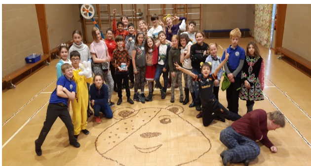
Children in Need