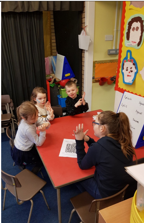
Raising money for hearing Dogs. We have sponsored 3 puppies this year!