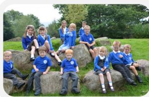
New Starters September 2014

New families—don't forget to check your emails regularly as it is our main way of communicating with you.