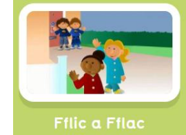
Fflic a Fflac