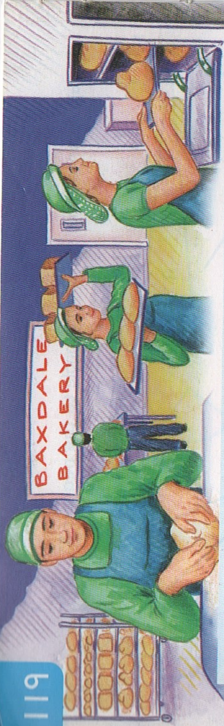
Loaves made at Baxdale Bakery