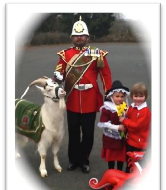
Celebrating St. David's Day with Shenkin the Goat Major

Our intention as a school is to encourage our pupils to become as bilingual as possible by the time they leave Sennybridge School. Children study the full range of subjects in the National Curriculum. For children receiving their education through the medium of Welsh, English is studied from Year 3 in KS2.