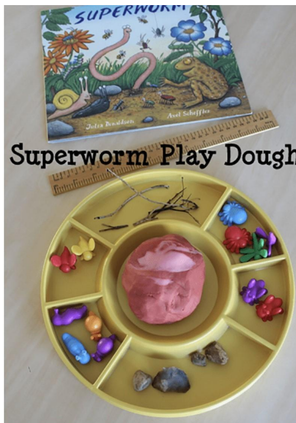
Superworm Play Dough

After reading the story, have a go at making some worms and insects you can find in the book. Playdough is great for fine motor development and lots of fun! If you haven't got any playdough at home, there is a simple no-cook play dough recipe below: