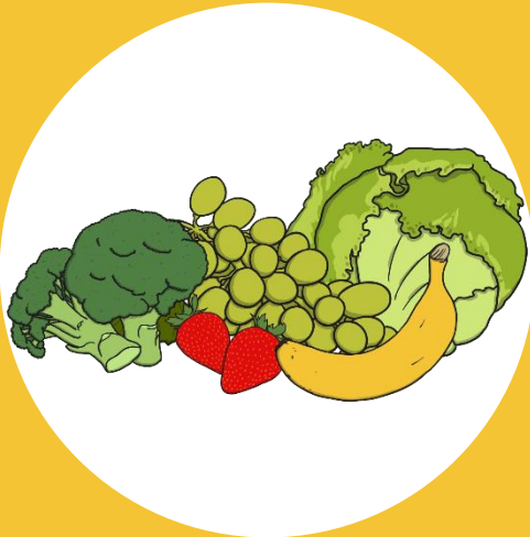
Fruit and vegetables