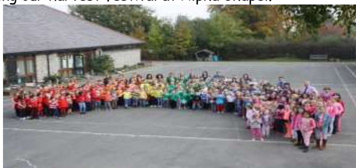
Make a rainbow for Haiti