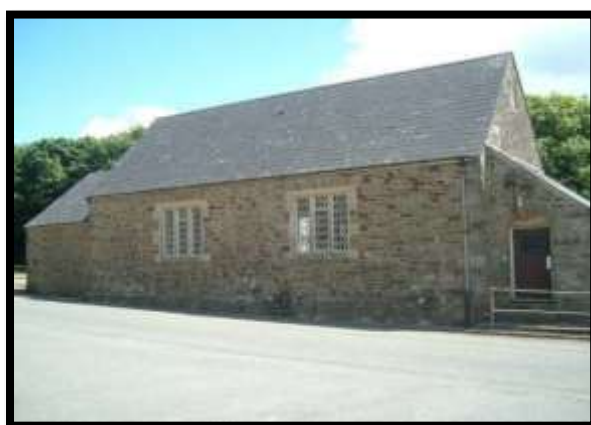
The old Victorian village school, vacated in September 2004 for our new building.

The School has a very active Parents and Friends Association (PFA) that organises regular fund raising and social activities, many of which are suitable for the whole village to attend. They are a great asset to the school and welcome all interested newcomers.