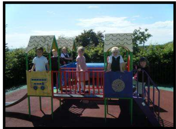
Children in Class One enjoying their outdoor play area

Residential trips and those occurring out of school hours involve risk assessments being completed that include all of the children's names, addresses and telephone numbers. Also on the form will be the names of the responsible members of staff, acceptable staff to pupil ratios, routes and costs. This form is sent to the Local Authority via a electronic system prior to the event taking place.