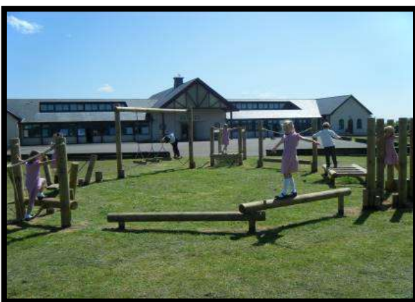
Our older children trying out the Trim Trail